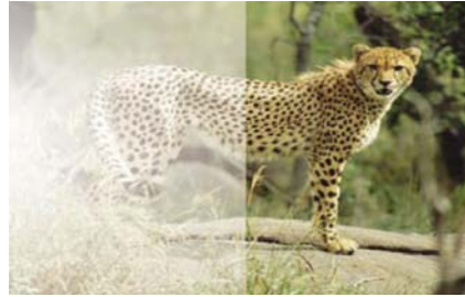
A normal screen in ambient light (left)...and an Planar Xscreen in ambient light (right).

Amazing performance is paramount to anyone who cares about great home theater. But so is design. And Planar has raised the bar on what big screen entertainment should look like. Imagine the sleek frame of the other high-end components in your home theater, engulfed in rich, sleek color and a high-gloss finish. Designed to complement your good taste and be something to be remarked upon, Xscreen creates pure joy for you and envy from your friends and neighbors. Finally, a solution that truly makes any room an impressive theater.