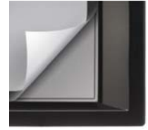
Xscreen uses a licensed filmsolution behind each screen to produce beautiful, rich images from any projector.